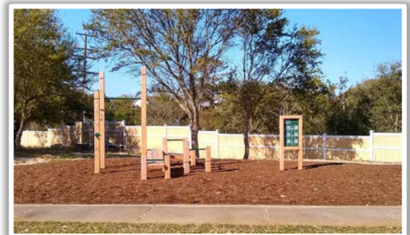
New! Outdoor Fitness Stations

The Main Pool will be opening Saturday, May 30. Enjoy some rays and swimming from 10-6 every day in two-hour cycles. Please be patient while we close for one hour after each cycle for cleaning. The Hammocks pool will also open for use by The Hammocks members and their guests on Saturday, May 30 with the same rules of operation as the Main Pool.